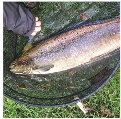
photos taken at Rivercatcher on the banks of the River Dee